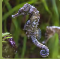
Unseen New World